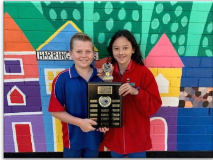
Pelicans win the day!