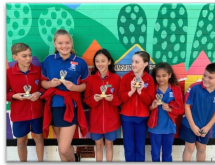
Champions receive their trophies!